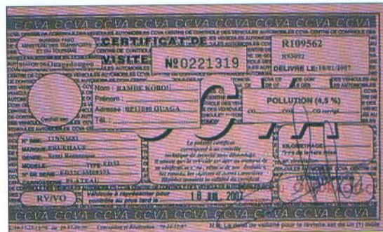
Certificat de Visite Technique Automobile Valid Roadworthiness Certificate