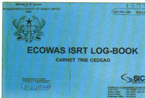
Carnet TRIE CEDEAO Inter-State Road Transport Logbook

BURKINA FASO CUSTOMS SERVICE should check :